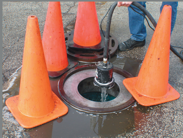
Basin Containment System